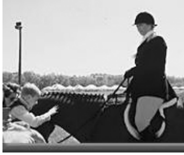
2002 Atlanta Steeplechase