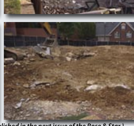
(A house construction timeline will be published in the next issue of the Rose & Star.)

Support Your Fraternity's Annual Fund Drive!