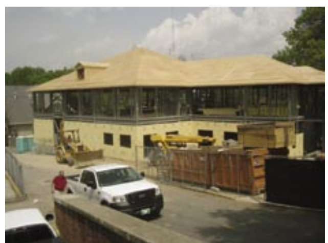
House renovations as of early April 2007.

Your pledge amount is certainly a personal decision and pledges/gifts of