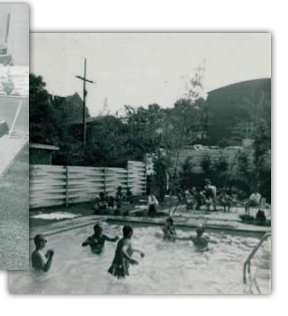
These pictures of the pool were sent in by Harvey Clarke (GA #983). THANK YOU BROTHER CLARKE!