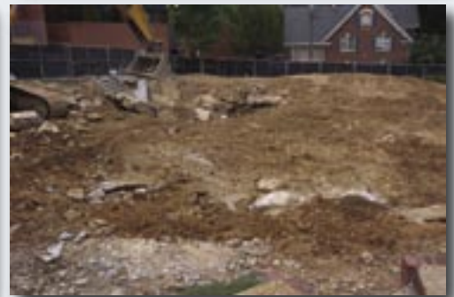
(A house construction timeline will be published in the next issue of the Rose & Star.)